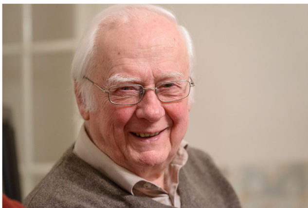
Fig. 1 Herbert Sukopp in 2016

cities as well as novel conceptual approaches to nature conservation and urban ecology as a multidisciplinary field of science.